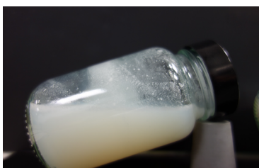
A. Soap formation without AKYPO® LF

5% MWF emulsion in 50°gH (890 ppm) Ca 2+ water with standard co-emulsifier (picture A) and with AKYPO® LF 4 (picture B) was stored for 2 weeks and increased electrolyte conditions by the adjustment of 200°gH (2080 ppm) NaCl. AKYPO® LF stabilize the emulsion by lime soap solubilization.