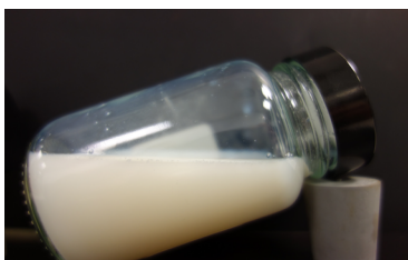
B. No soaps with AKYPO® LF