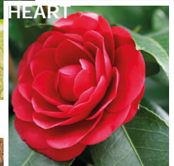
Camellia japonica, Turkish Rose