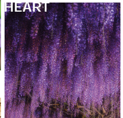
Royal purple Wisteria, Sugar-Plums, Cherry Blossom