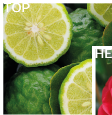
Calabrian Bergamot, Pink Pepper