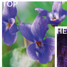
Yuzu, Violet Leaves, Fresh Raspberry